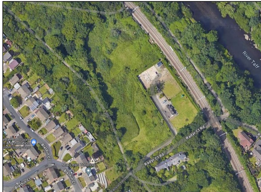
Properties to the south east and south of the application site

that the report has not directly referred to the assessment of the impact of the development on the privacy and amenity of occupiers of properties to the south east and south of the application site, known as Ty Isaf, Silverton, Mount Pleasant and Hillside respectively, and as shown below: