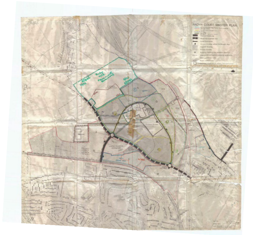
Danescourt Master Plan 1978

Danescourt & Llandaff Ward as documented in recent planning records, today, still has a deficit of public open space. Any POS designated in 1978 should be protected and enhanced as per PPW 11.