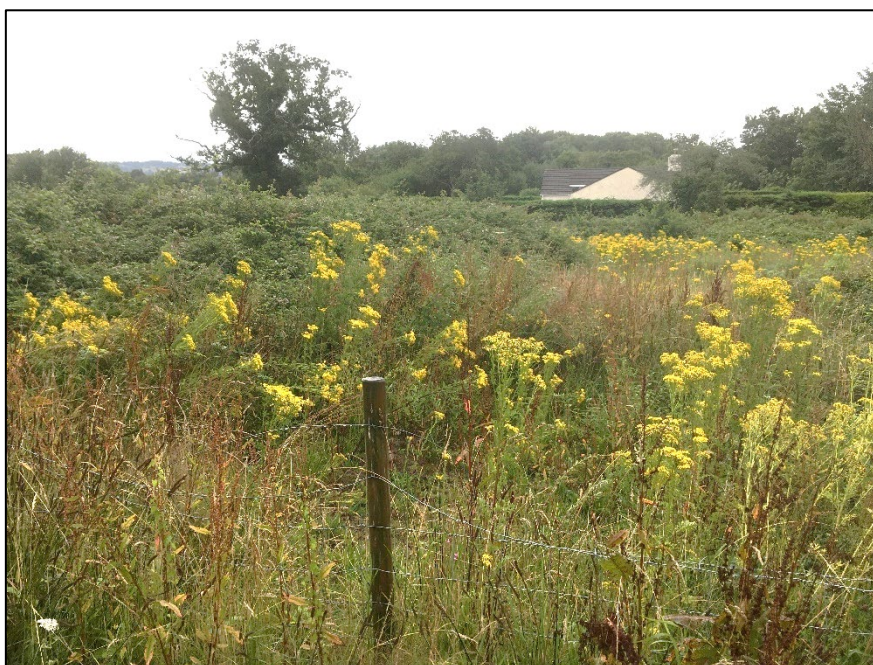
View of Ty Isaf

The property known as Ty Isaf lies to the south east of the application site, and is the closest property to the site, set around 4.2 metres away from the shared boundary. The property is bordered by a large hedge, and has no windows in the side elevation at first floor level, as shown below: