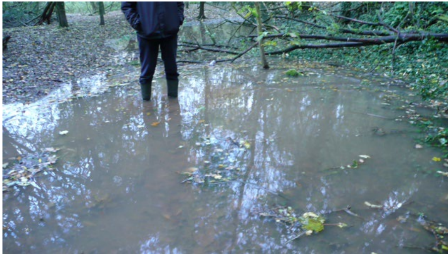
Area of Proposed Community Woodland Strategy - Pic 4