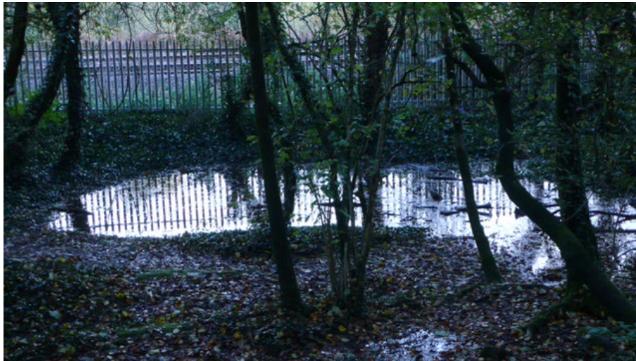
Area of Proposed Community Woodland Strategy - Pic 1