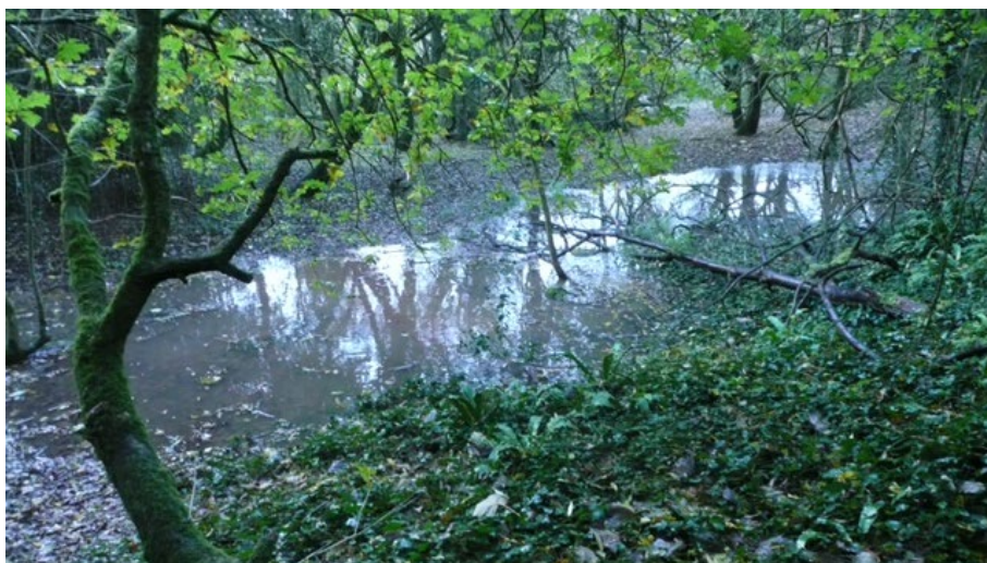
Area of Proposed Community Woodland Strategy - Pic 3