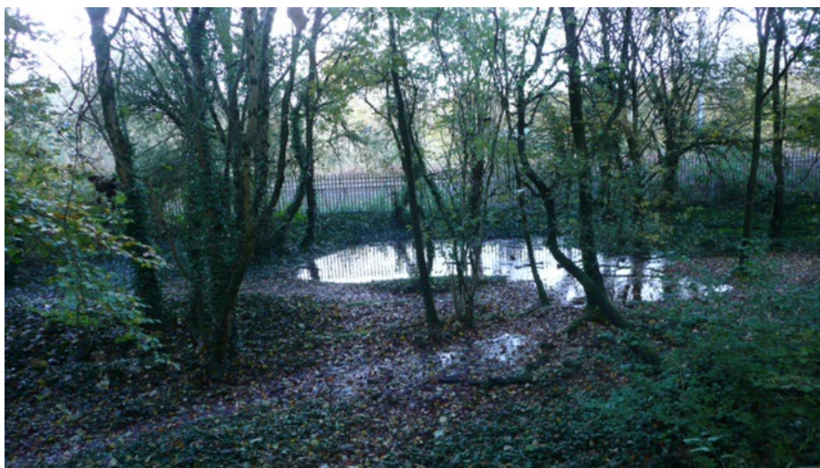
Area of Proposed Community Woodland Strategy - Pic 2