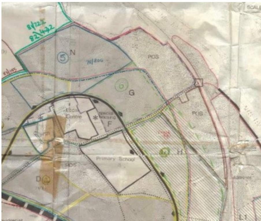
Danescourt 1978 Public Open Space POS

Enclosed below: copies of a section of the original Masterplan that clearly identifies the area proposed for development and the DESIGNATED PUBLIC OPEN SPACE (POS).